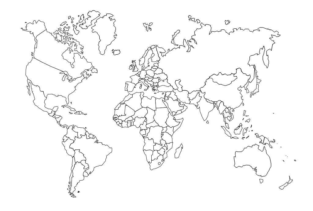
APAP ACTION PROFESSIONALS' ASSOCIATION FOR THE PEOPLE Addis Ababa, Ethiopia (1996)

with Resource Materials for Facilitators of Non-Formal Education and 24 Human Rights Echo Sessions